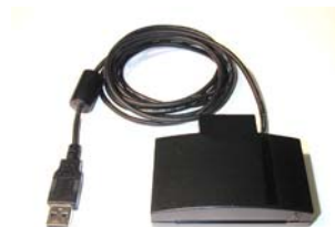
Service Card Reader