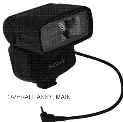
OVERALL ASSY, MAIN