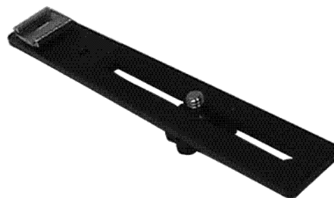
ADAPTOR, ACCESSORY SHOE