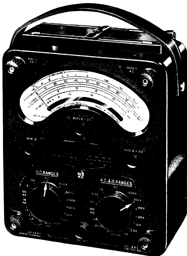
THE MODEL 8 AVOMETER MK. II