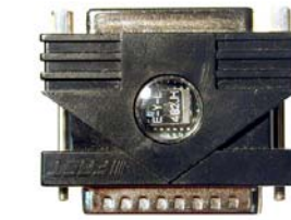
KRY 105 165