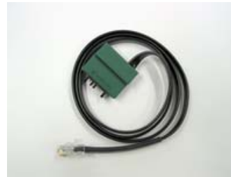
KRY 101 1115