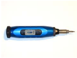
NTZ 112 459