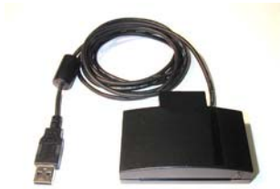
LZY 213 1191