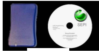
LTN 214 1484